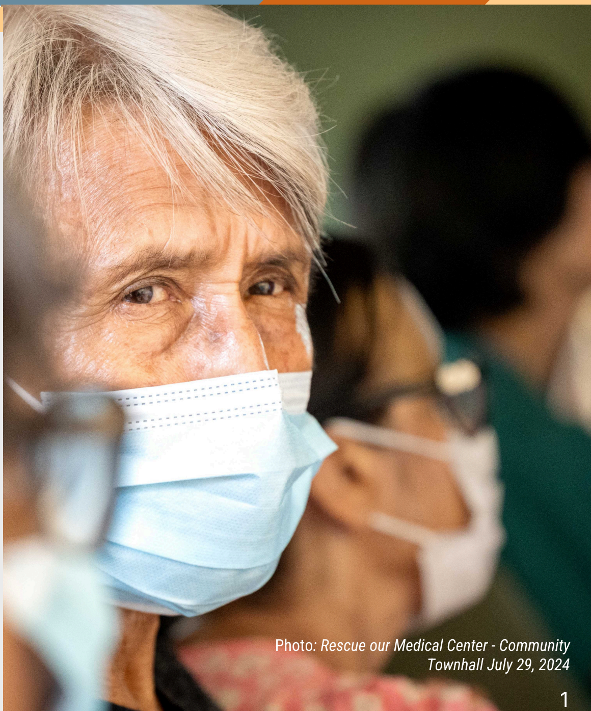
Photo: Rescue our Medical Center - Community Townhall July 29, 2024