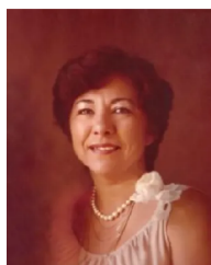
Ferrer Family Giving